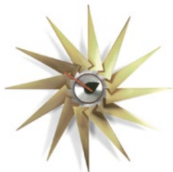
Turbine Clock, brass/aluminium, Ø 765