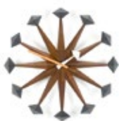
Polygon Clock, walnut, Ø 430