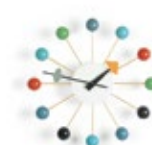
Ball Clock, multicoloured, Ø 330