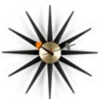
Sunburst Clock, black/brass, Ø 470