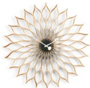
Sunflower Clock, birch, Ø 750