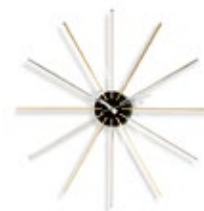
Star Clock, chrome/brass, Ø 610