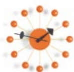
Ball Clock, orange, Ø 330