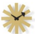
Asterisk Clock, brass, Ø 250