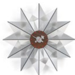
Flock of Butterflies, aluminium, Ø 610