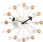
Ball Clock, beech, Ø 330