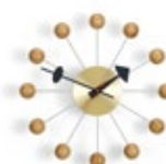
Ball Clock, cherry, Ø 330